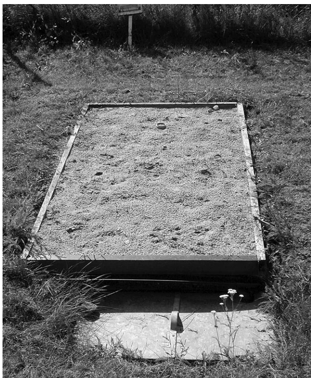
Fig. 2. The microplot with sandy soil.

quantity of erosion losses on different soils under field conditions were compared. It was possible when different types of soils were collected in one place where some erosion factors (L, S, C, P) and rain factor (R) were uniform.