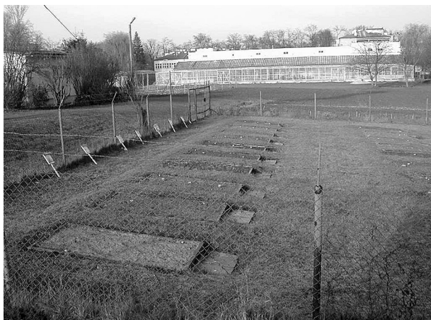
Fig. 1. The microplot experiment in Puławy — one replication.

The experiment was designed on the experimental field of the Institute of Soil Science and Plant Cultivation in Puławy, Poland. The microplots (1 m x 2 m; 0.3 m deep) were installed on the field with a slope equal to 10% (Fig. 1). Microplots in two replicates were filled with humus horizon of the soil and maintained in clean-tilled fallow (Fig. 2). The experiment was carried out on the 10 most typical soil types in Poland, differentiated both in soil texture and soil organic matter content (Table 1). The textural groups of tested soils diversified from sandy and loamy to silty. The aim of the field microplot study was to determine soil losses and runoff affected by natural rainfall events. The quality and